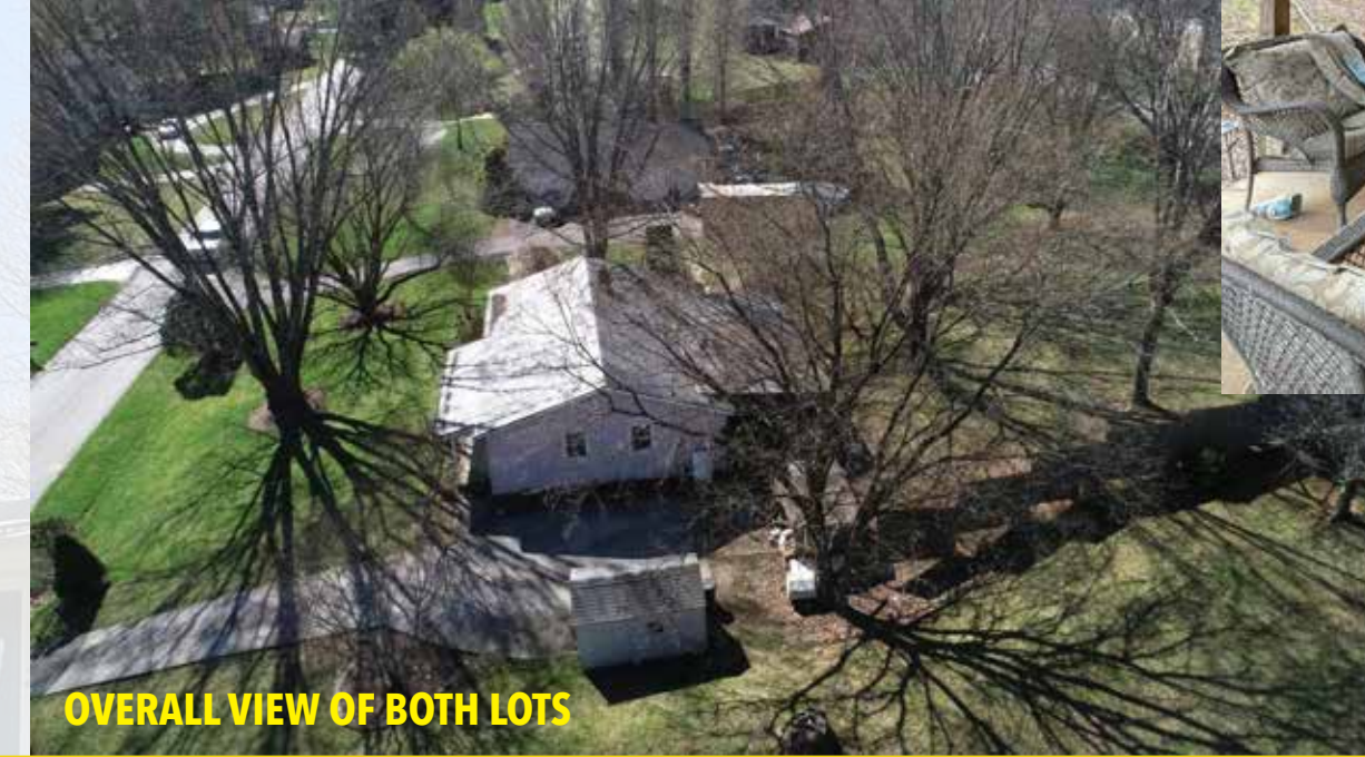
OVERALL VIEW OF BOTH LOTS