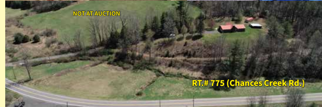
RT.# 775 (Chances Creek Rd.)